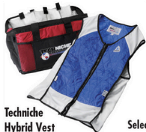
Techniche Hybrid Vest

Officials, Turn Marshals and Crews — You have not been forgotten. Try the Techniche Evaporative Cooling Towels. Just soak in water and you'll stay cool for hours. Only $10.95