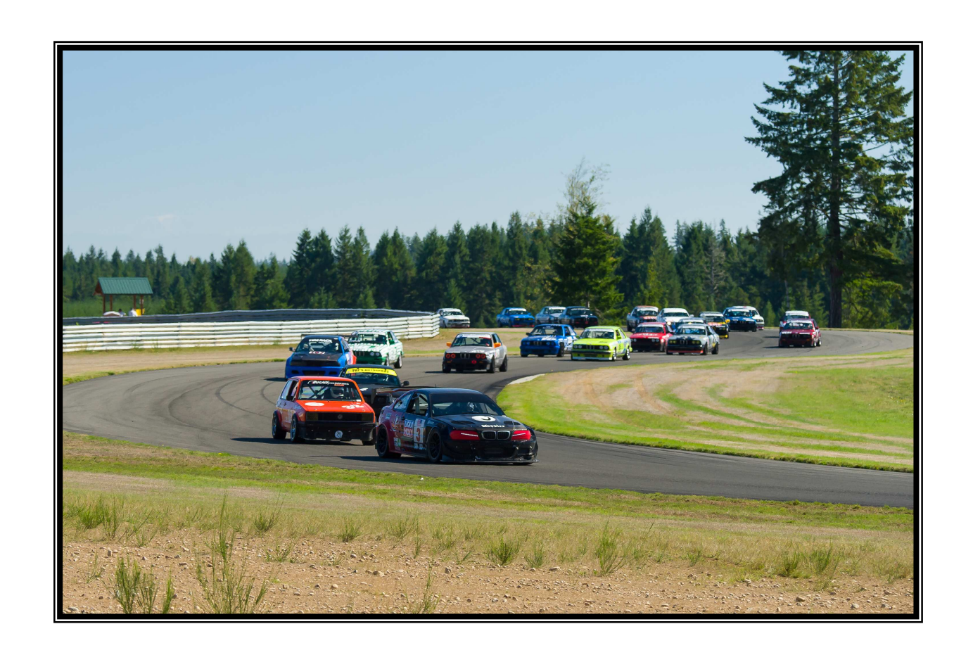
Fun at The Ridge