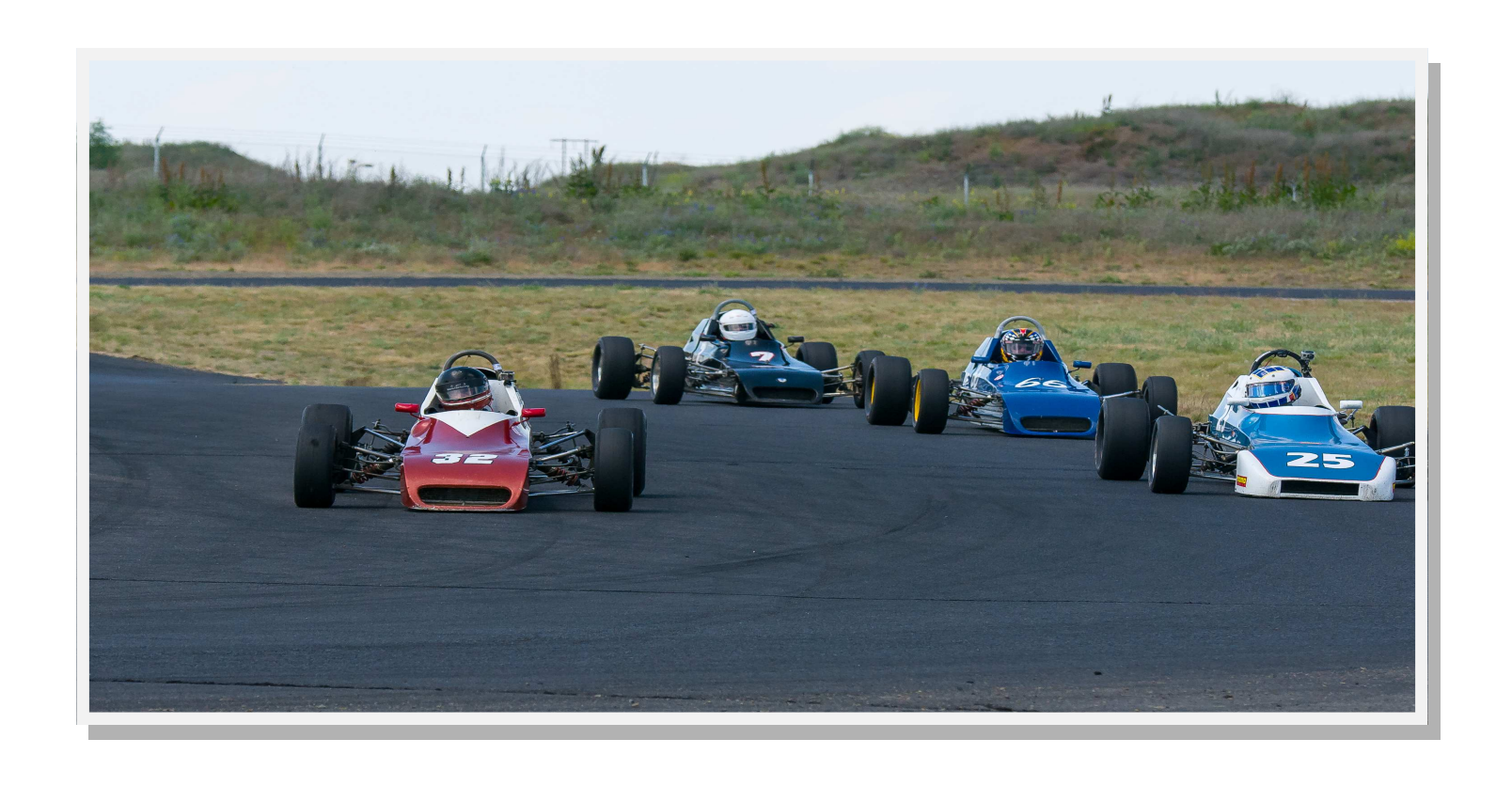
Showing our stuff at NWMS Triple in Spokane