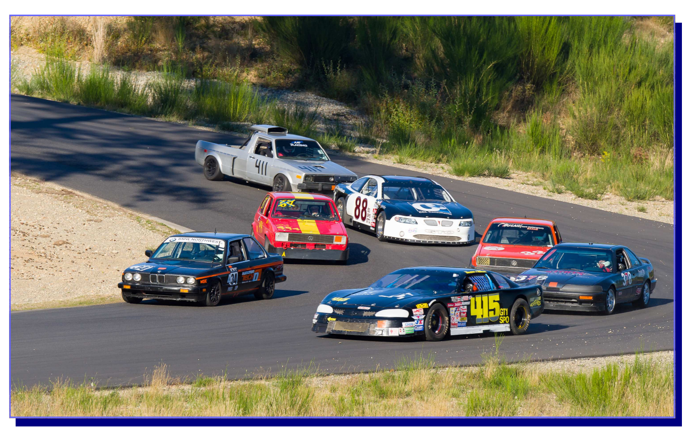
IRDC at The Ridge