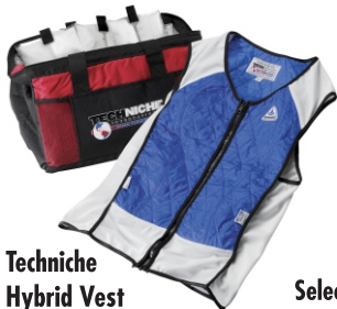
Techniche Hybrid Vest