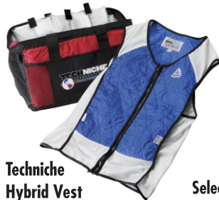
Techniche Hybrid Vest

Officials, Turn Marshals and Crews — You have not been forgotten. Try the Techniche Evaporative Cooling Towels. Just soak in water and you'll stay cool for hours. Only $10.95