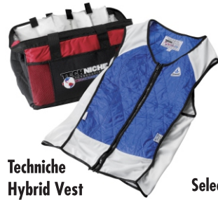
Techniche Hybrid Vest