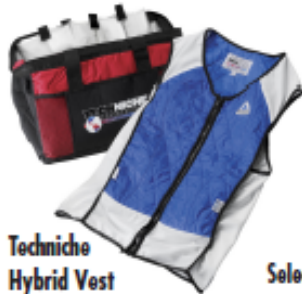
Techniche Hybrid Vest