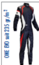
ONE B00 suit 235 gr/m 2

Complete vest and phase change packets only $199.99 . In stock and ready to keep you cool. Officials, Turn Marshals and Crews — You have not been forgotten. Try the Techniche Evaporative Cooling Towels. Just soak in water and you'll stay cool for hours. Only $10.95