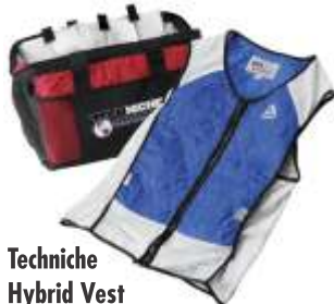
Techniche Hybrid Vest

Officials, Turn Marshals and Crews — You have not been forgotten. Try the Techniche Evaporative Cooling Towels. Just soak in water and you'll stay cool for hours. Only $10.95