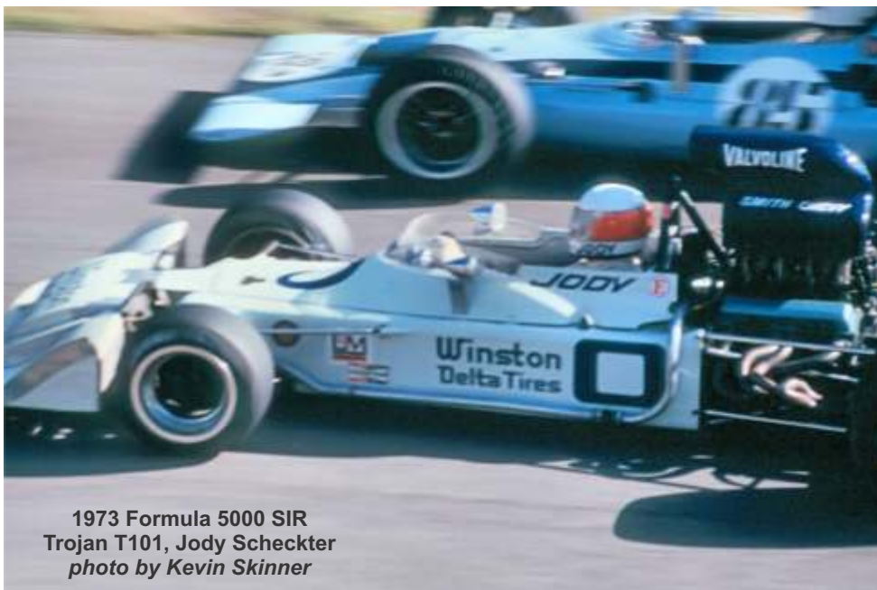
1973 Formula 5000 SIR Trojan T101, Jody Scheckter