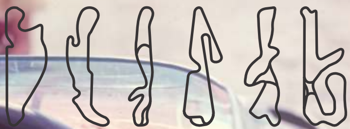
1969 Formula Continental SIR

Largest selection of in-stock safety equipment in the NW