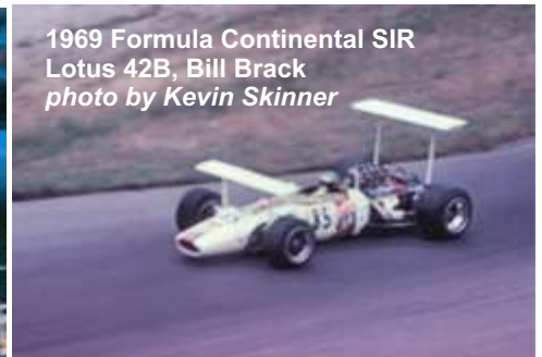
1969 Formula Continental SIR Lotus 42B, Bill Brack