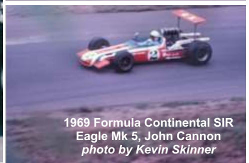
1969 Formula Continental SIR Eagle Mk 5, John Cannon