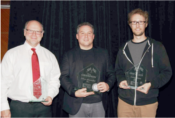
ICSCC 2016 Pro3 Trophies