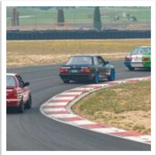
See more photos at www.dbpics.com