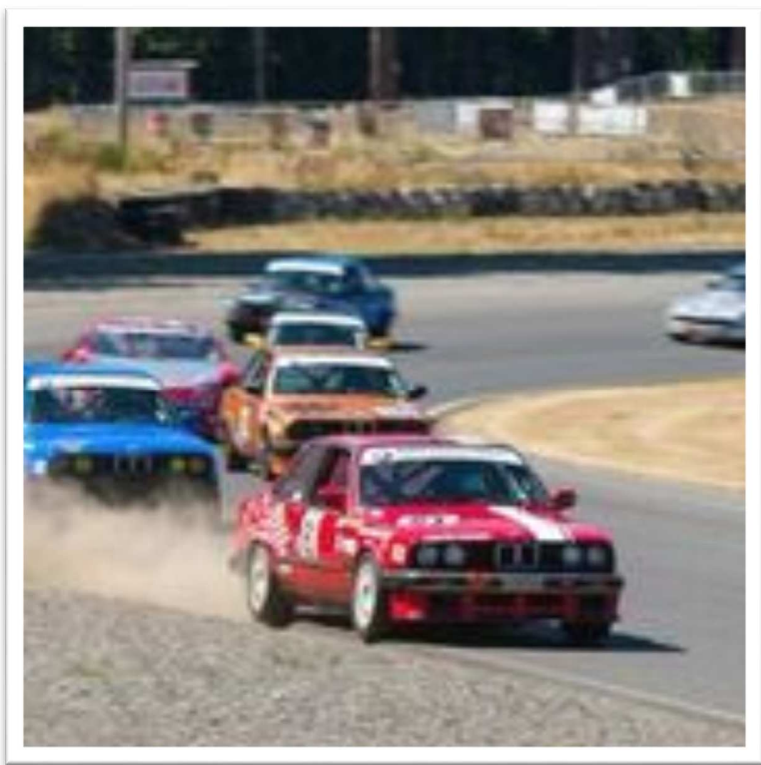
IRDC at The Ridge 2015