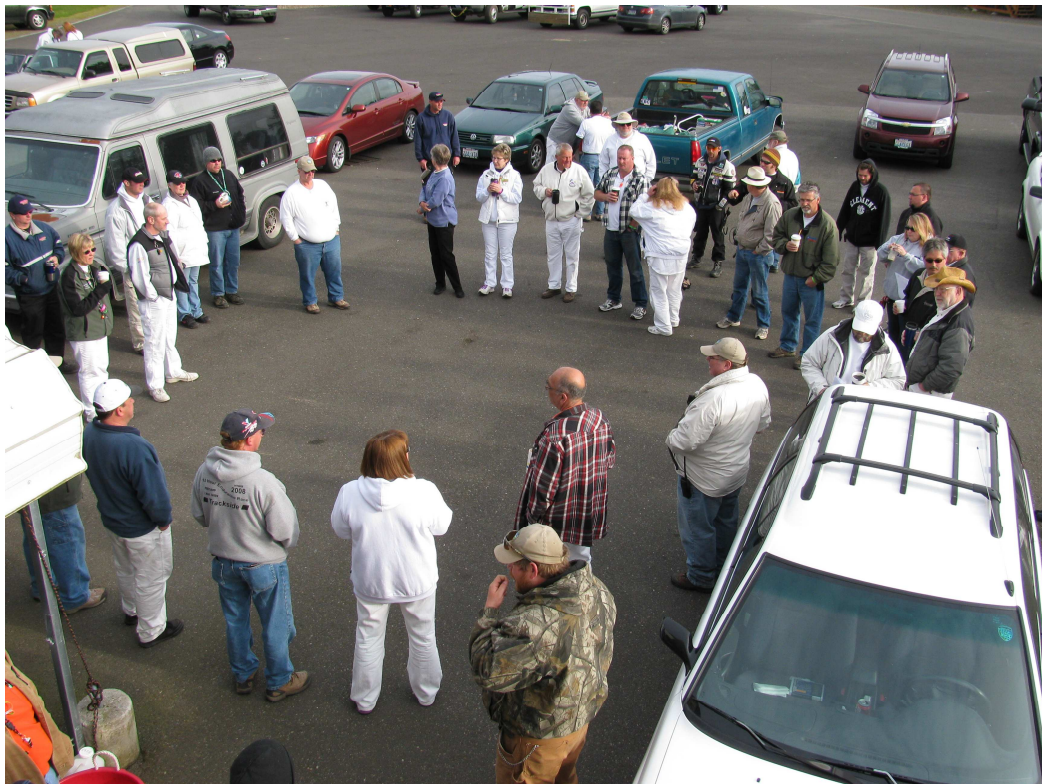
Organizing the day with CSCC workers

By the time you read this month’s “ENDURO CORNER”, the 6 HOURS ON THE RIDGE will be only a few weeks away. This means endurance racing is upon us!! Less than three weeks after the 6 hour at The Ridge comes the start of the NORTHWEST MINI ENDURO CHAMPIONSHIP SERIES . New for 2014 is that the one minute mandatory pit stop will be for both one driver and two driver entries. Also new is an extended pit window which increases the window from 10 minutes to 20 minutes. A slightly tighter point structure should add to an even closer championship points battle!!! The NWMECS is a great chance for drivers to increase their track time as well as their race time during the weekend. Next month we will start to touch on the year end CASCADE FESTIVAL OF ENDURANCE which will feature something for just about everybody. The NWMECS 2 HOUR FINALE , the BORDER CHALLENGE 300 , and the 8 HOURS OF THE CASCADES will give drivers and teams several choices to fulfill their endurance appetite!!!