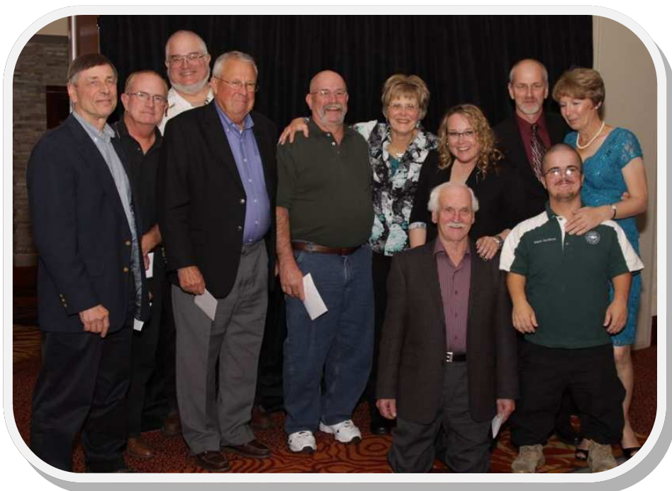
ROD Members honored at the ICSCC Banquet 2014