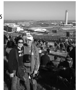
Armadillos Ana and Andy check out The F1 Cars and their MyLaps Transponders At the Circuit of the Americas

Flex transponder with 1 year subscription is only $150, 2 years at $215, and 5 years at $370. Why spend up to $50/weekend for a rental when you can race a whole season for just $150? Original lifetime Direct Charge or Rechargeable transponders $480.