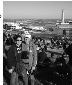
Armadillos Ana and Andy check out The F1 Cars and their MyLaps Transponders At the Circuit of the Americas

Flex transponder with 1 year subscription is only $150, 2 years at $215, and 5 years at $370. Why spend up to $50/weekend for a rental when you can race a whole season for just $150? Original lifetime Direct Charge or Rechargeable transponders $480.