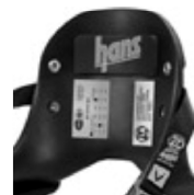
New Sport II HANS