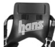
Sport I HANS