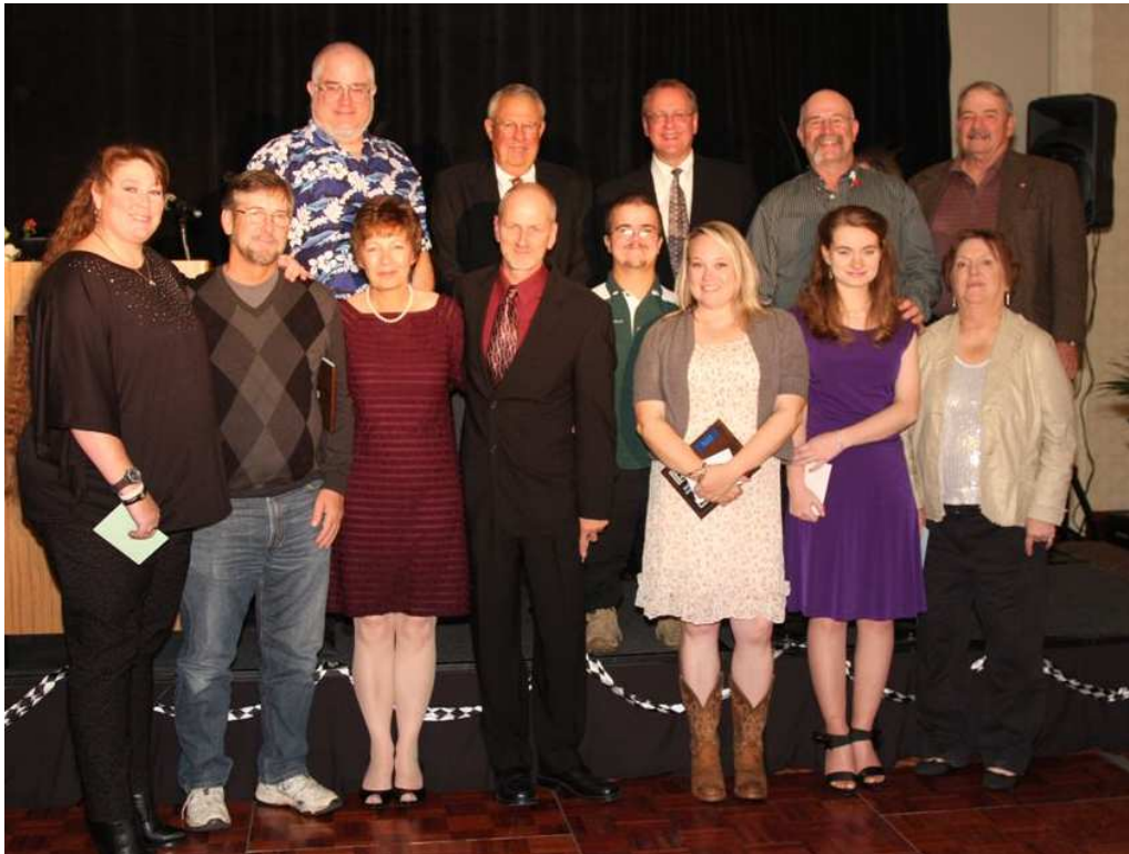
A few of our terrific Race Officials