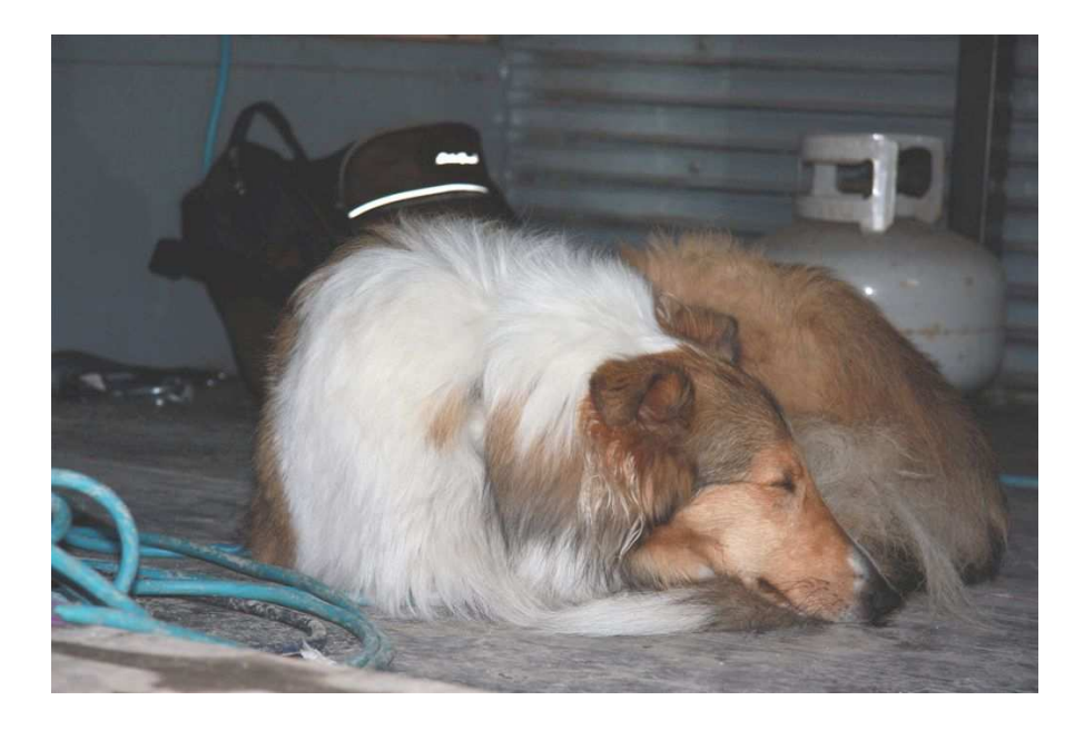
Photo courtesy of Sue Phypers at Rainbow Action Imagery. Thanks, Sue!

Excitement at the track is sometimes just underwhelming