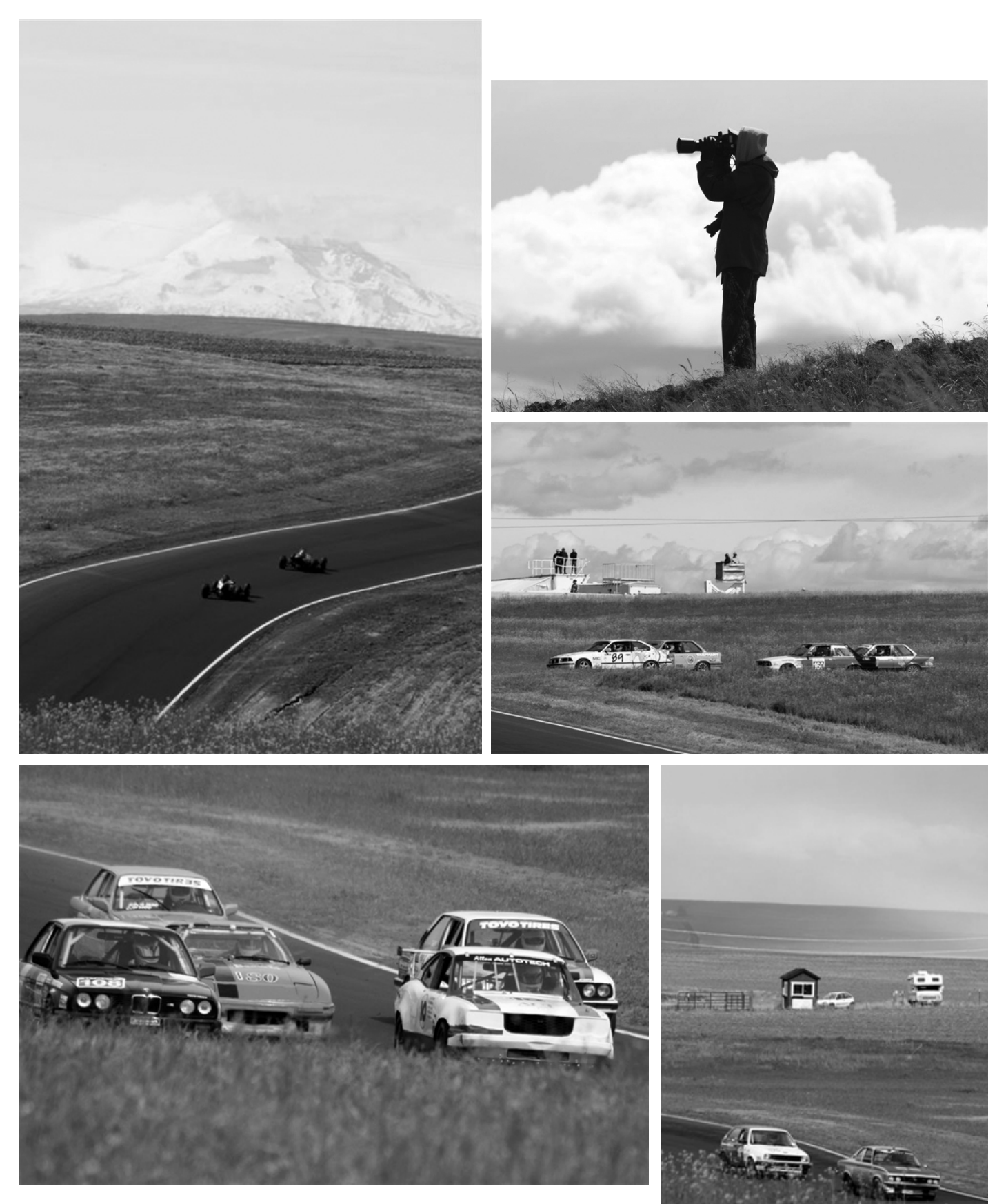
Oregon Raceway Park, May 2010