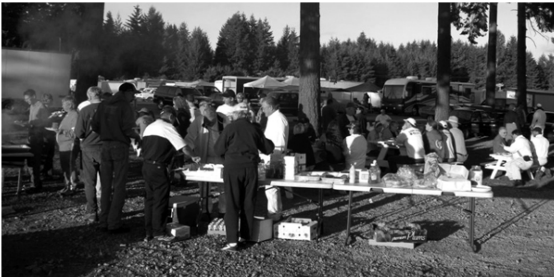
All photos in this issue are courtesy of and copyright Gerry Frechette / Sue Phypers and Rainbow Action Imagery.