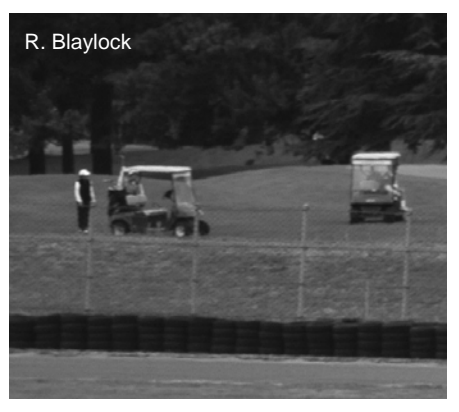
Photos by, or courtesy of, the person named on each... my thanks to everyone who has responded to my call for photos to use in the Memo!