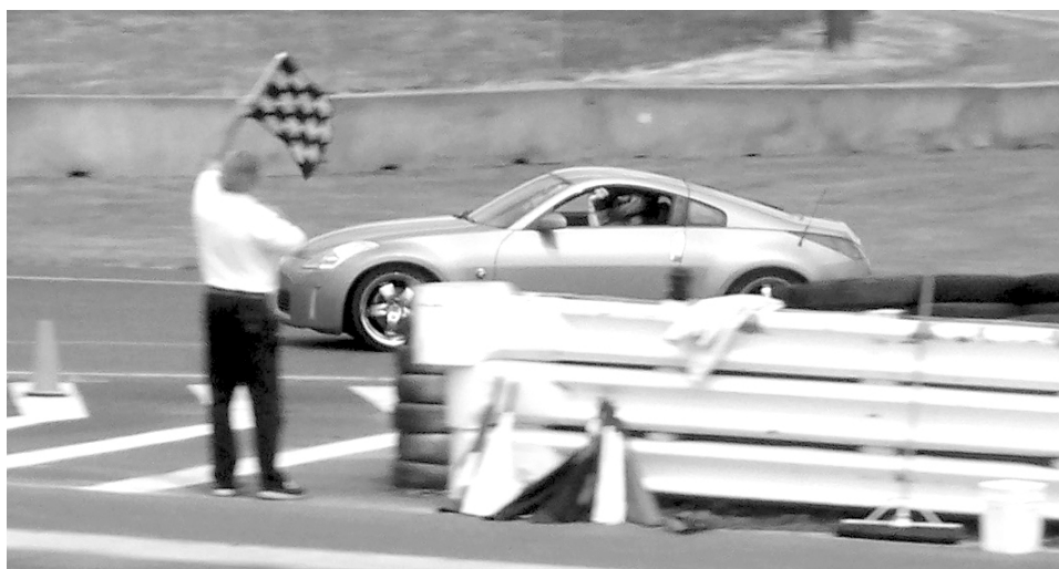
from a recent Driver Training at PIR.